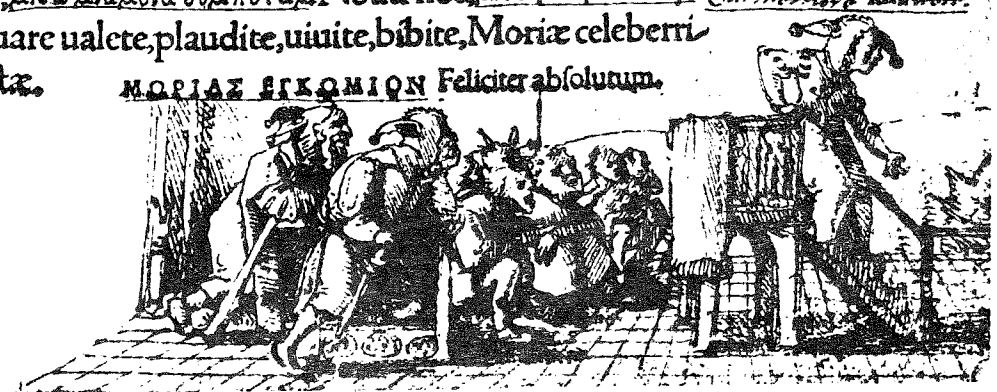
Holbein. Drawing from Erasmus's copy of In Praise of Folly

tus illud, μισῶ μνάμονα συμπόταμ. Nouū hoc, μισῶ μνάμονα ἀκροα. Οὐκ ἐπιμένοντα ἀκροα. Quare ualete, plaudite, uiuite, bibite, Moria celeberrimi Mylta. ΜΟΡΙΑΣ ΕΙΣΚΟΜΙΩΝ Feliciter absolutum.